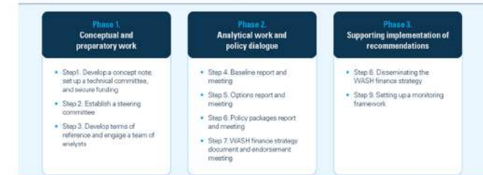
Figure C. Phases of the WASH finance strategy process

It is important to identify the window(s) of opportunity that may favour the initiation of a WASH finance strategy, most importantly integration with and building on government policy and budget processes. If a country is not ready for a full WASH finance strategy, it is worth considering a phased or modular approach, picking low-hanging fruit and building support for a full finance strategy.