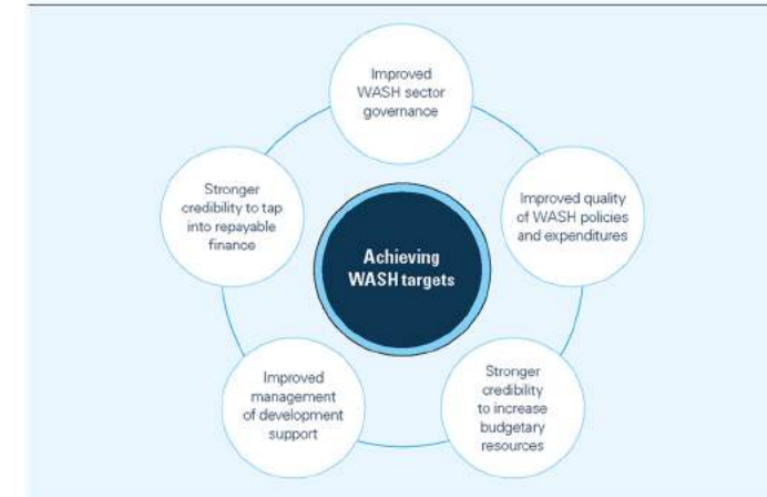
Figure B. Benefits of developing a WASH finance strategy